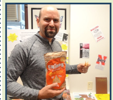
Notice the Nebraska Bugeaters shirt and Huskers poster—Big Red is everywhere!