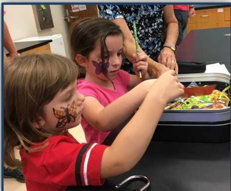
What better to do after butterfly face painting than to unlock some prizes in Escape!