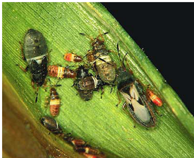
Figure 1. Chinch bug life stages.

The chinch bug is a native North American insect that can destroy cultivated grass crops, especially sorghum and corn, and occasionally small grains, such as wheat and barley. Broad-leaved plants are immune to feeding damage. Crop damage from this insect is most often found in southeast Nebraska and northeast Kansas and is associated with dry weather, especially in the spring and early summer months. Chinch bugs have few effective natural enemies. Ladybird beetles and other common insect predators found in Nebraska prefer to feed on other insects rather than on chinch bugs. Although chinch bugs can be difficult to control, many farmers have satisfactorily protected their crops with an integrated program of careful crop management and insecticide application.