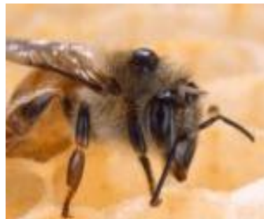
Honey bee with a Varroa mite on its back. Workshop training will include how to detect and suppress this damaging mite.