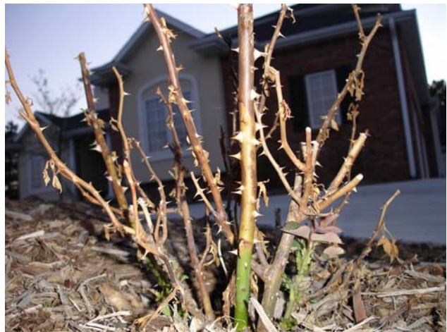
A rose plant in my yard whose foliage has been killed by the frost with a new green shoot appearing

Spring arrived early in the northern hemisphere and the roses and flowering trees were all in bloom when a severe frost, lasting several days, killed the new growth. Most plants recovered once it warmed up but some did not and this means replanting of flowers and ornamental plants in the yard. This year I have planted tomatoes and cucumbers for the first time in many years so I will get some practice in vegetable IPM. I am hoping for good cooperation by the biological control agents in my plantings.