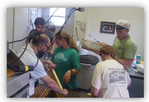
Extracting honey in September at Mead