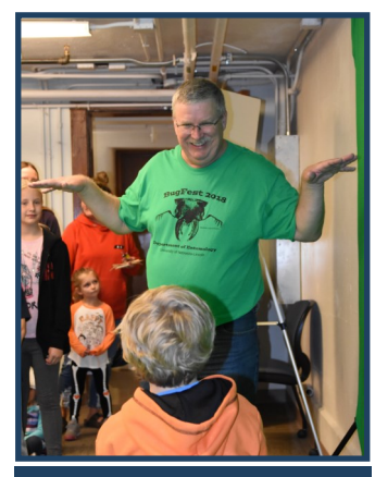
Praying mantid (kind of