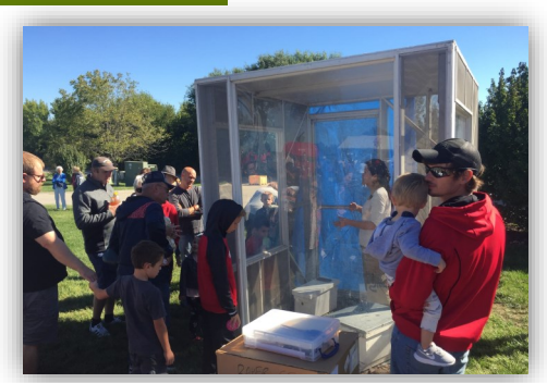
Beekeeper in a Box at AppleJack Festival