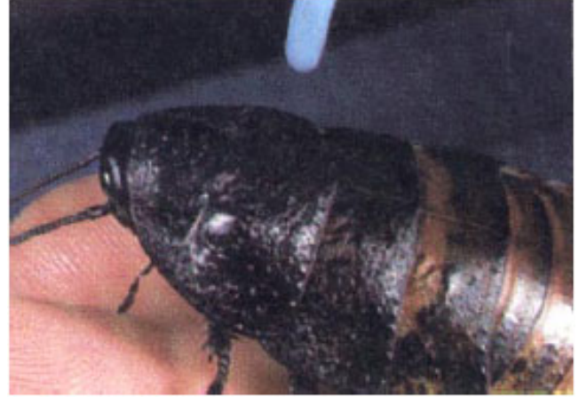
Figure 2. Female Madagascar Hissing Cockroach.

stars). It requires nearly five months for the roaches to become sexually mature.