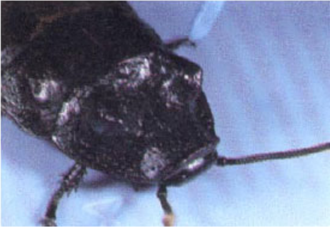
Figure 1. Male Madagascar Hissing Cockroach.